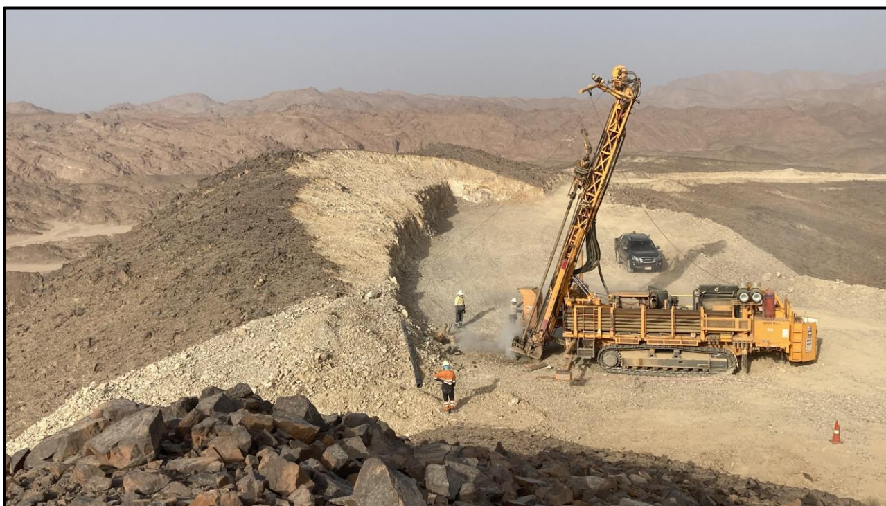
Figure 2: Collaring off the first hole WGP-006 at West Garida, 18 May, 2023

Drilling has commenced at the West Garida prospect (Figure 1), which is only 3 km away from the Company's Hamama West deposit. A short programme of 19 holes has been planned at West Garida, for a total of 1,370 metres to follow up on a previous drill intersection of 41.7 g/t Au, 263 g/t Ag and 2.08% Pb over a 1m interval (see news release dated September 1, 2022). Mineralisation at West Garida is associated with narrow high grade quartz veins.