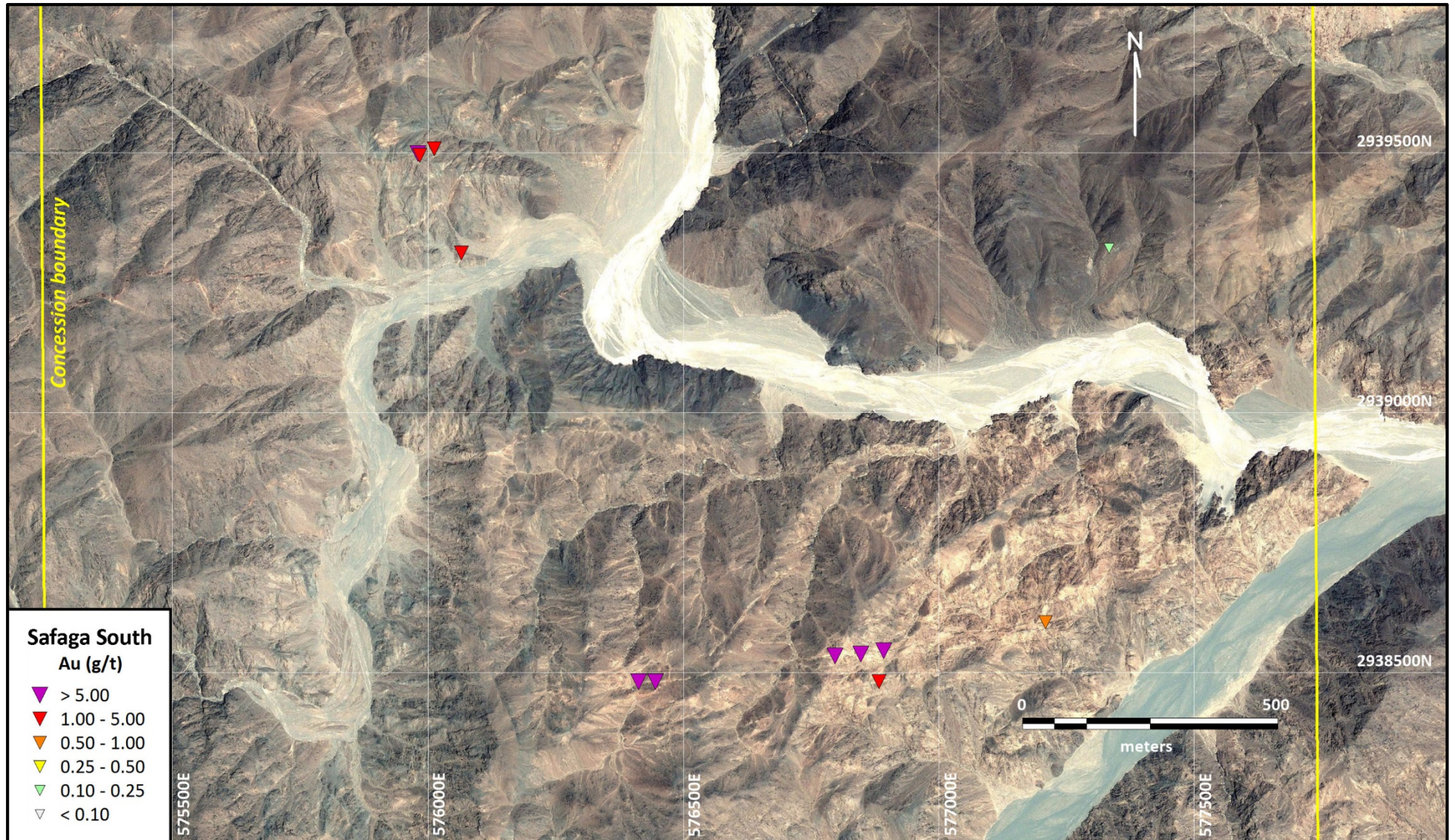
Figure 3: Safaga South prospect, showing the location of surface samples