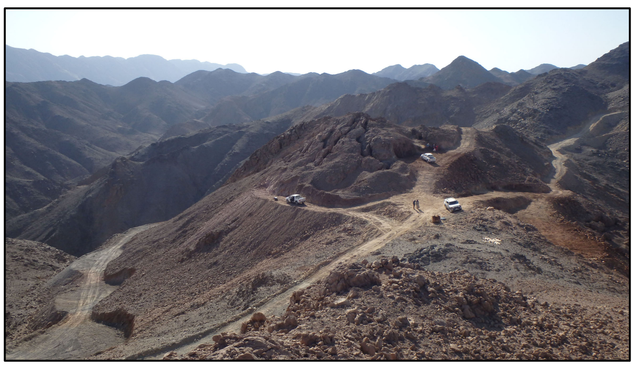
Figure 2: Aladdin's Hill area at Rodruin, showing the main zone of ancient workings on the hill itself, and the current drill access road and pad layout (viewed from the southeast)