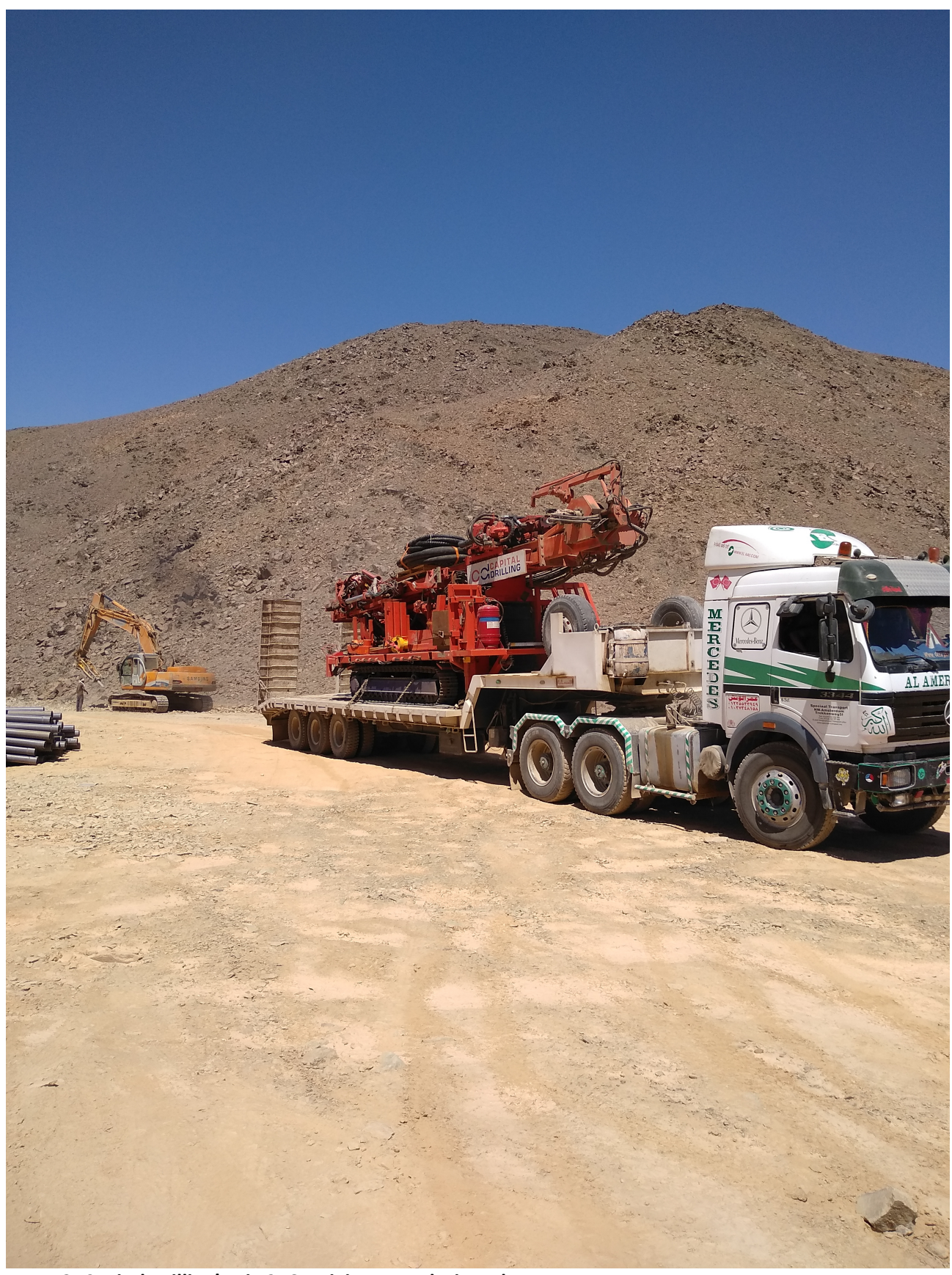
Figure 3: Capital Drilling's Rig 256 arriving at Rodruin today.