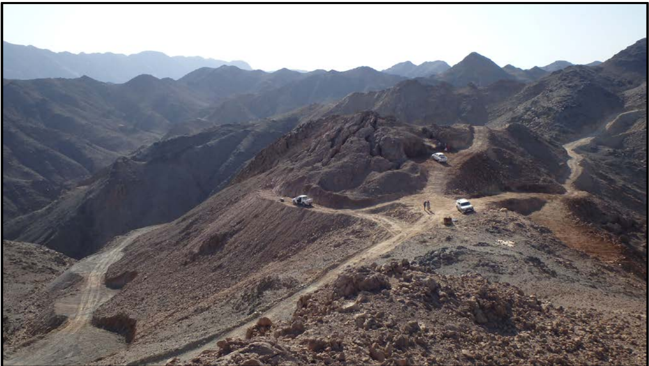
Figure 2: Aladdin's Hill area at Rodruin, showing the main zone of ancient workings on the hill itself, and the current drill access road and pad layout (viewed from the southeast)