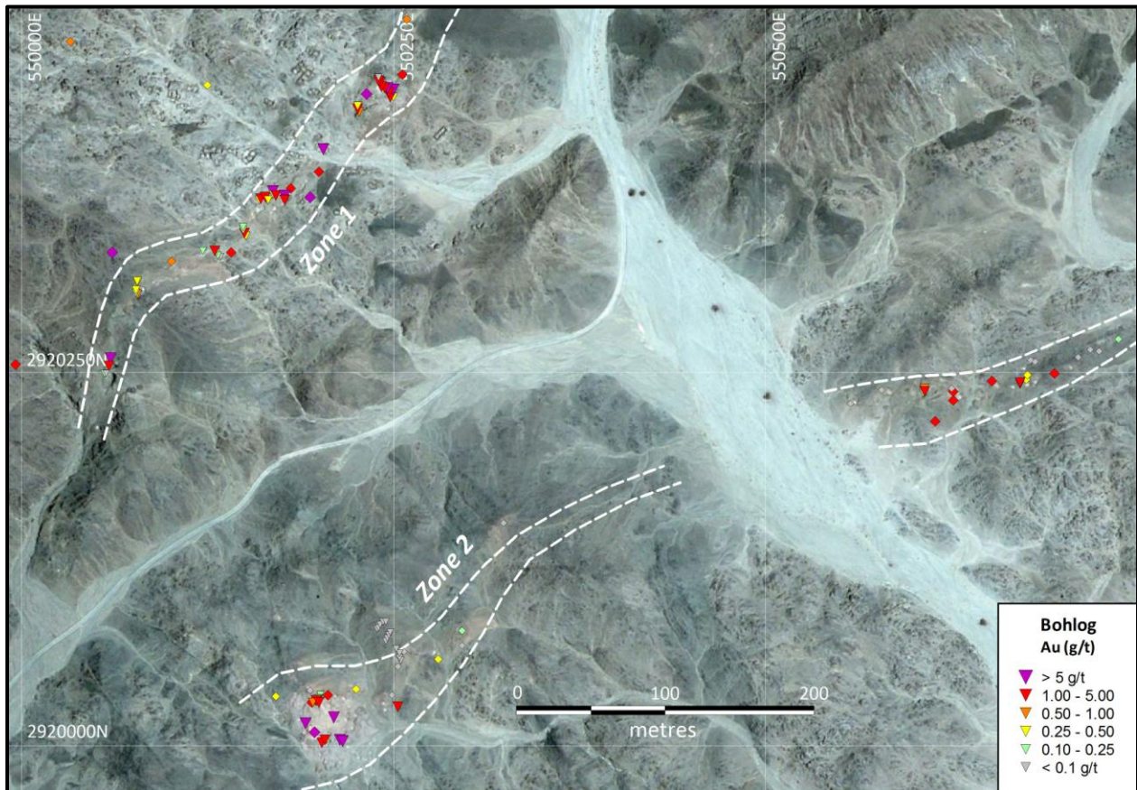
Figure 3: Sample locations and grades from the Bohlog prospect

Upside-down triangles are 2017 samples; diamonds are 2012 samples